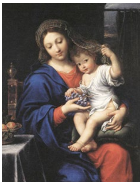
Madonna of The Grapes by Pierre Mignard

For this reason we celebrate Mother’s Day!