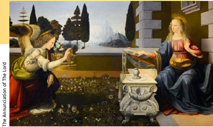
The Annunciation of The Lord