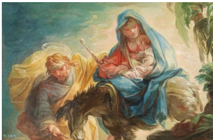
La Huida a Egipto, López Portaña - Vicente. Museo Del Prado

Imagine if the inn keeper had known who was looking for a room? Would he not have opened wide the doors of his home? Assuredly, he would have given up the warmth of his own room to accommodate the Holy Family. Let us not be like the busy,