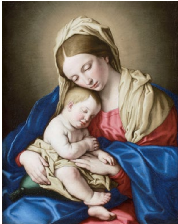
Madonna and Child, GIOVANNI BATTISTASALVI II