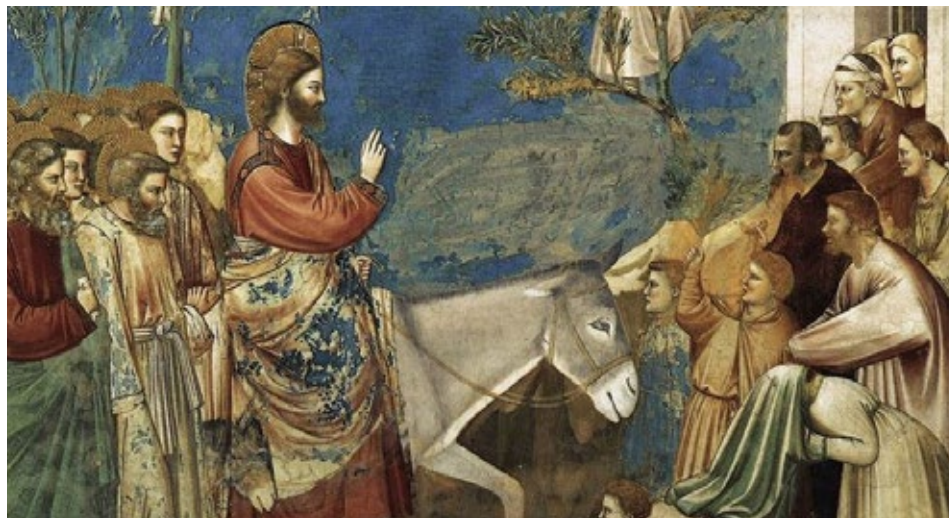
Giotto, «Entry into Jerusalem»