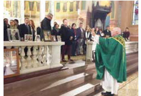
10:30 AM. Mass