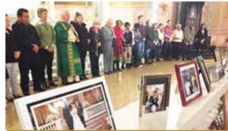
12:00 PM. Mass