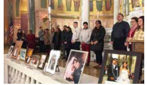
9:00 AM. Mass

El domingo pasado, 11 de febrero, celebramos el "Domingo Mundial del Matrimonio". Un gran número de parejas casadas de San José recibieron una bendición especial en nuestras tres liturgias dominicales. Felicidades por ser testimonio de amor y compromiso!